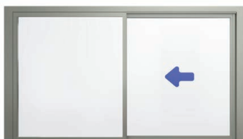
OX (O=Fixed glass, X=Sliding glass)